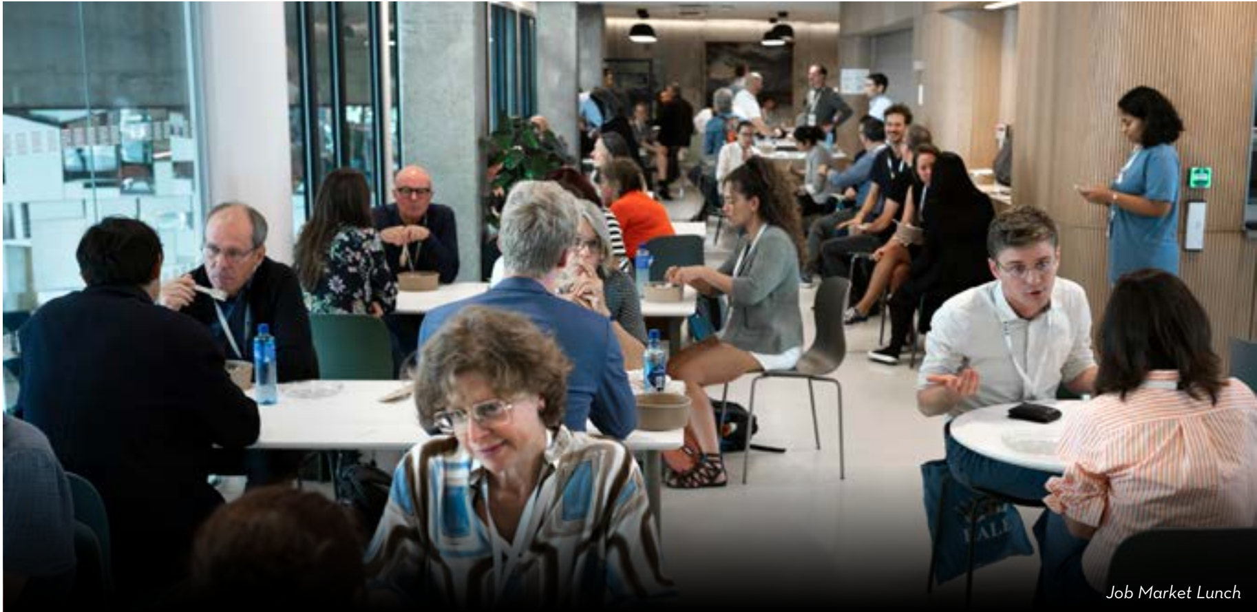
Job Market Lunch