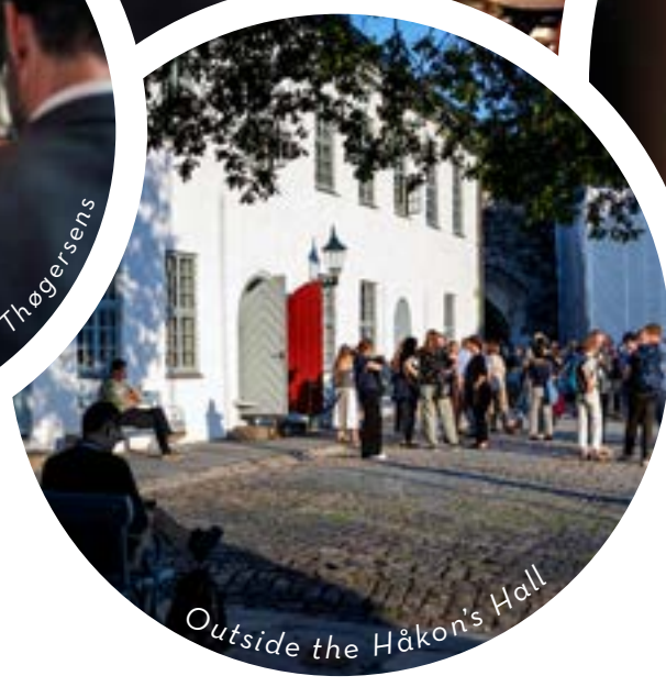
Outside the Håkon's Hall