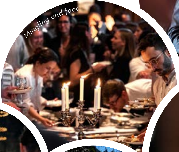
Mingling and food